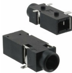
stereo audio jacks