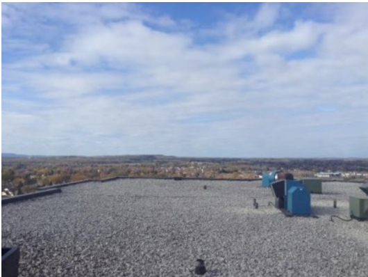
the view from TBR