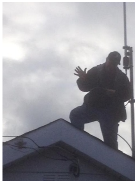
“I think that’s the way it’s supposed to go”