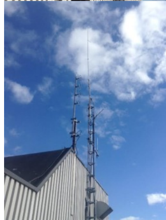
shiny new antennas and VE3TBR is back in service.