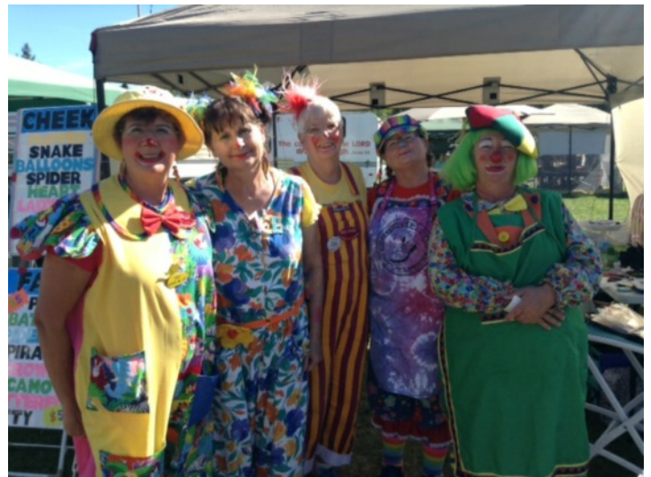
apparently these lasses have a thing for radio operators ..... especially the one on the far left

Seems logical to me .....A woman asks her husband, a programmer, to go shopping.