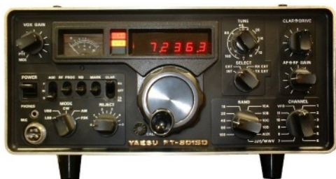
Yaesu FT-301SD Transceiver with FP-301 power supply is $150