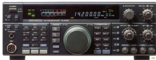
Kenwood 450S HF Transceiver with PS53 power supply $550