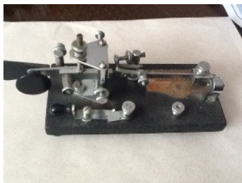
The Vibroplex morse key is $50